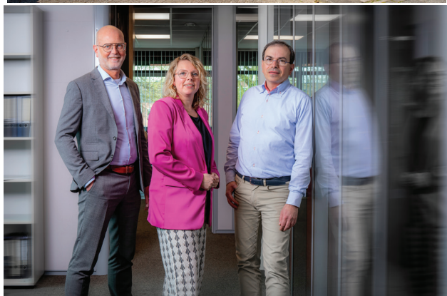
Above: Huisman Adviseurs offices, Rotterdam-Hoogvliet